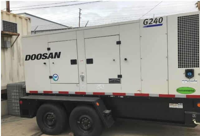
200 kW generator owned by the City of Long Beach, one of twenty-three such generators purchased collectively by the Cities of Long Beach and Los Angeles with FEMA funds.

The LAC EMS Agency is vital in supporting hospitals with health and medical resources (i.e., personnel, pharmaceuticals, supplies, and equipment) during disasters when these resources are in short supply at facilities. For example, during the COVID-19 pandemic, the LAC EMS Agency coordinated the receipt and distribution of millions of pieces of PPE to hospitals. Generators are not traditionally considered a health and medical resource. However, since the LAC EMS Agency has the coordination responsibility for medical and health response, and is the only health agency that owns FEMA generators, it will play the lead role in helping hospitals and sub-acute SNFs access temporary government generators during an outage.