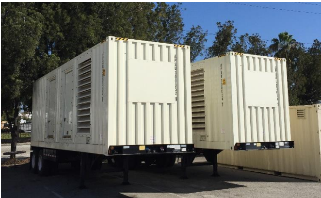
Two 800 kW generators owned by the LAC EMS Agency that are part of the fleet of twelve such generators purchased collectively by LAC and the City of Los Angeles using FEMA funds.

The two lead agencies that will address threats to emergency power at hospitals and sub-acute SNFs during a power outage are the LAC EMS Agency and the LAC Public Health Department. The LAC EMS Agency, a division of the LAC Department of Health Services, plays a lead role in ensuring the readiness of the county's hospitals.